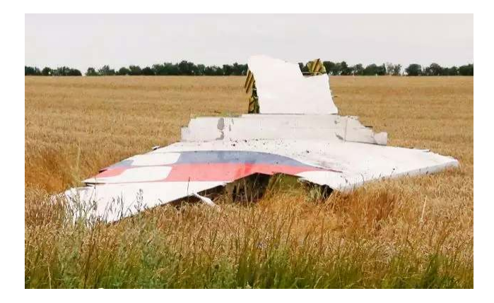
A part of the Malaysia Airlines Flight MH17 that crashed after being hit by a missile in eastern Ukraine.

Barely minutes later, the AI pilots heard the controller trying to establish contact with the Malaysian aircraft. When no response came from the Malaysian crew, the controller asked the AI pilots to try. It is standard practice for air traffic controllers to ask pilots of aircraft in the vicinity to get in touch with pilots who have stopped responding.