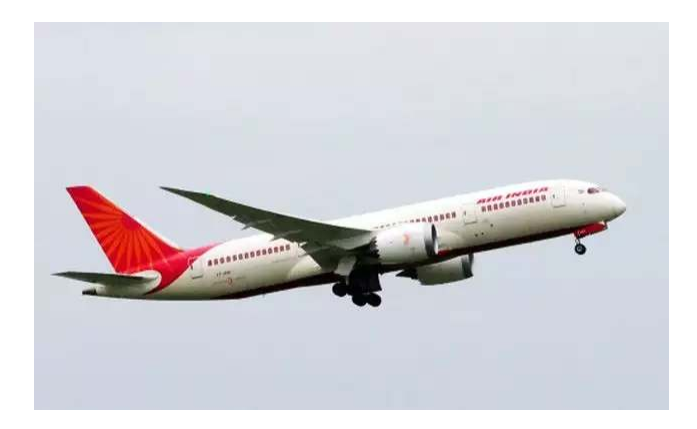
An Air India Boeing 787 Dreamliner.

"The AI Dreamliner was less than 25km away from the Malaysian aircraft when the latter was hit by a missile. When the pilots learnt the cause of the crash later, they were stunned. It's like the person standing next to you has been hit by a sniper bullet," said the source.